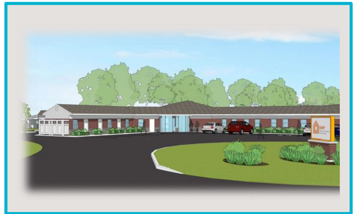
Artist Renderings – subject to change