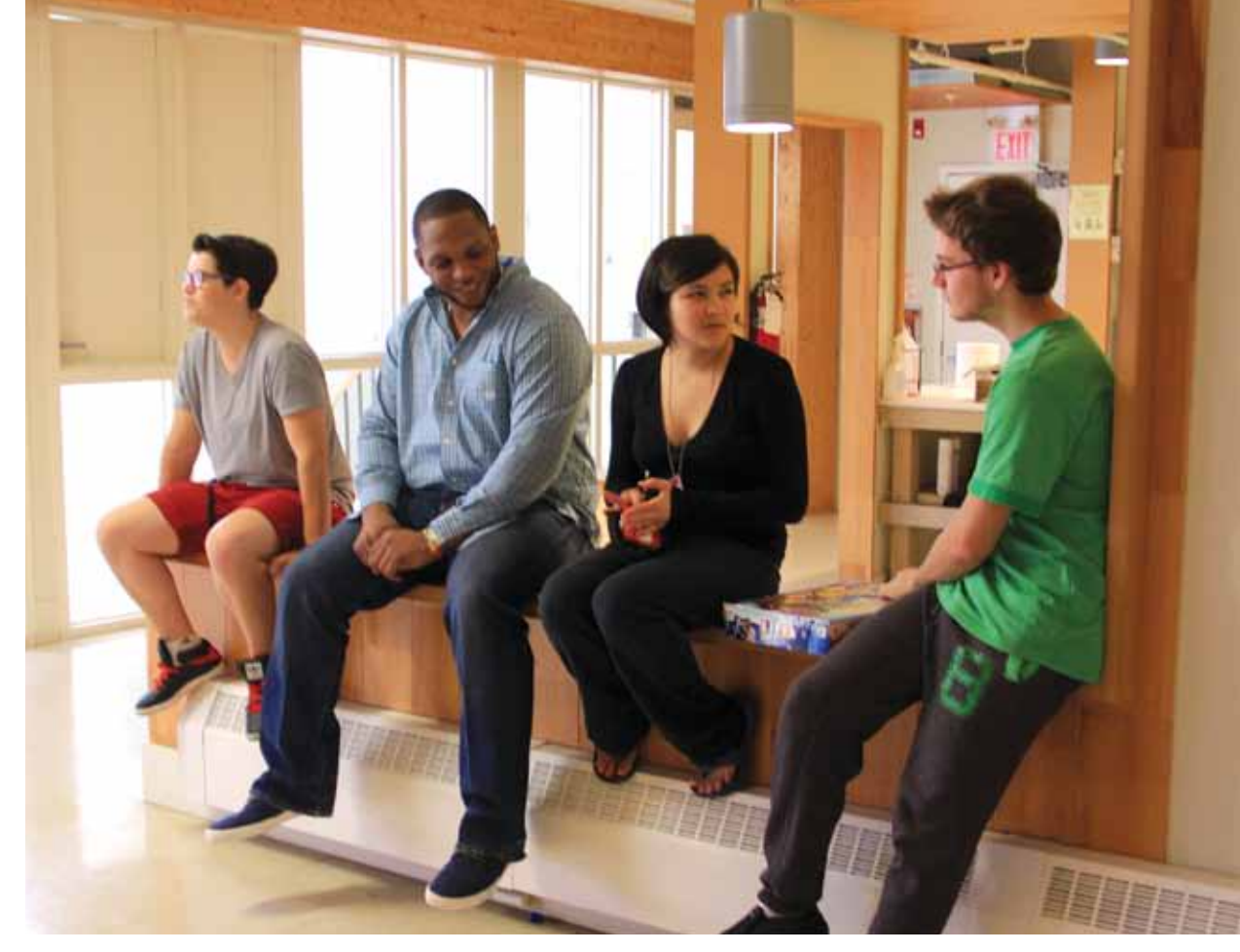
Together, residents and SHIP staff identify the levels of support needed and put them in place.

On behalf of neighbouring residents, a community needs assessment was carried out to determine ways in which SHIP can better meet those needs. A survey was conducted within the Acorn community to identify current needs and guide development of programs and activities at PYV resulting in a community calendar that is as rich and diversified as the community.